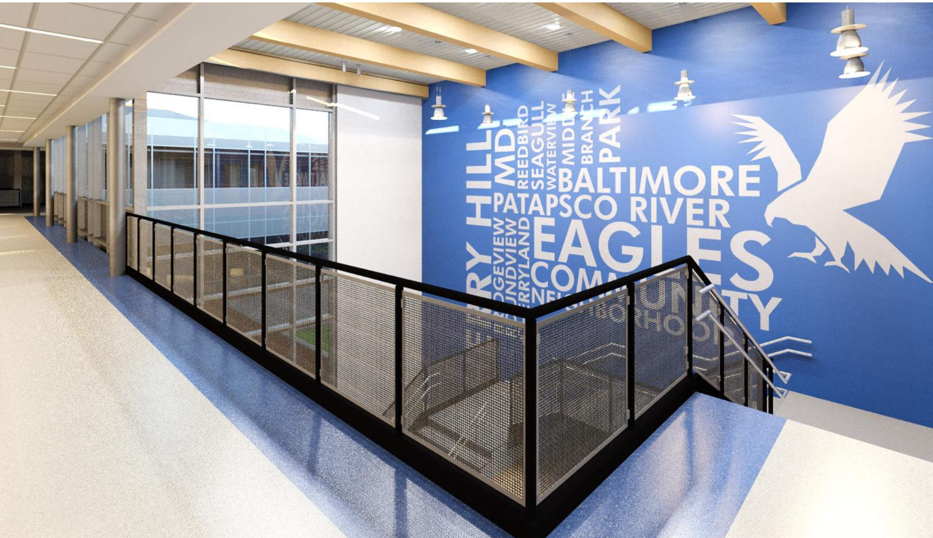
INTERIOR VIEW: SECOND FLOOR CENTRAL STAIRCASE