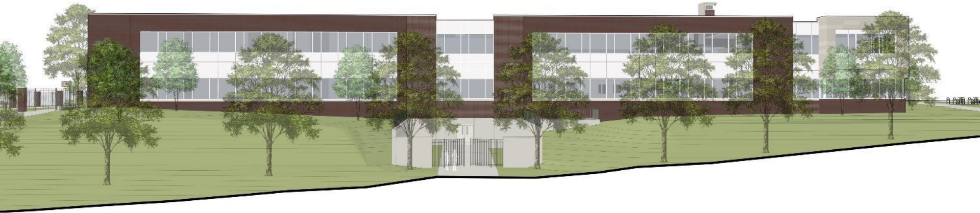
SIDE VIEW, CHERRYLAND ROAD