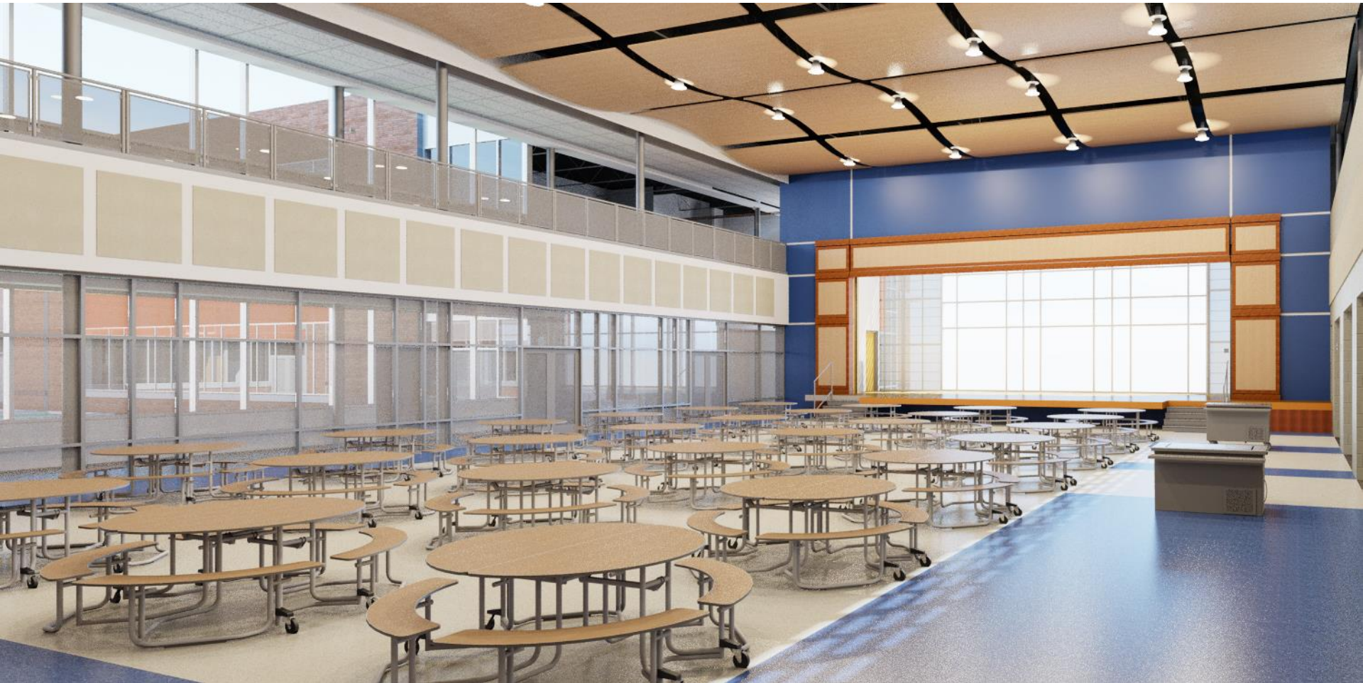
INTERIOR VIEW: CAFETORIUM