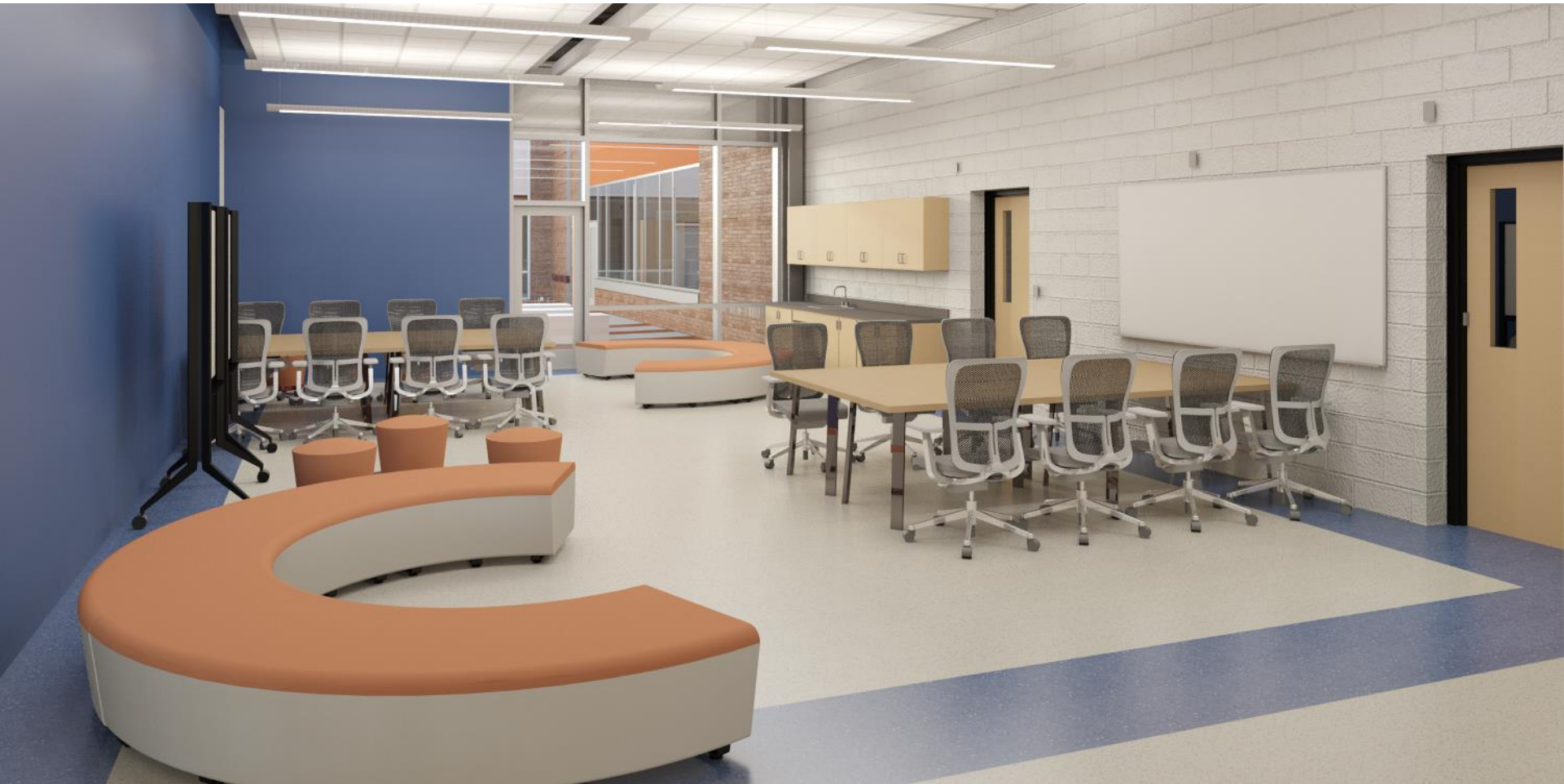
INTERIOR VIEW: COLLABORATION SPACE