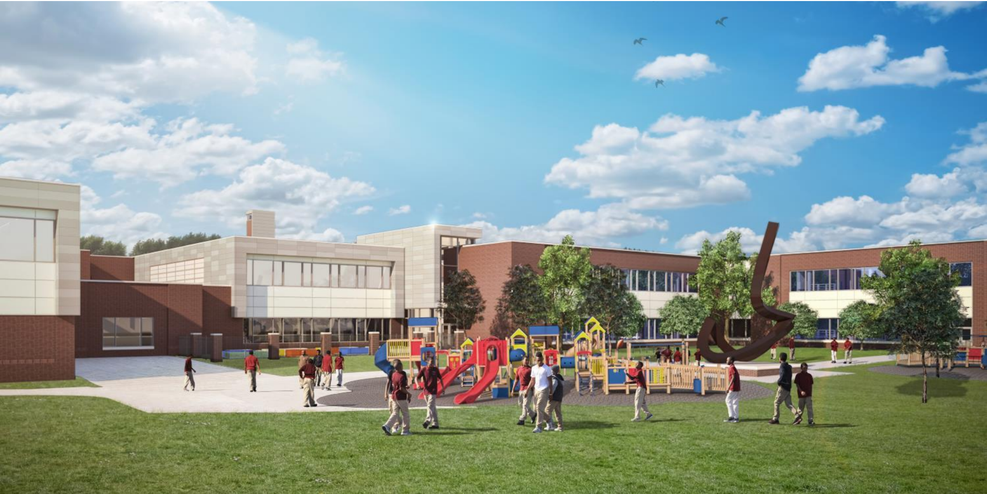
EXTERIOR VIEW: REAR PLAYGROUND