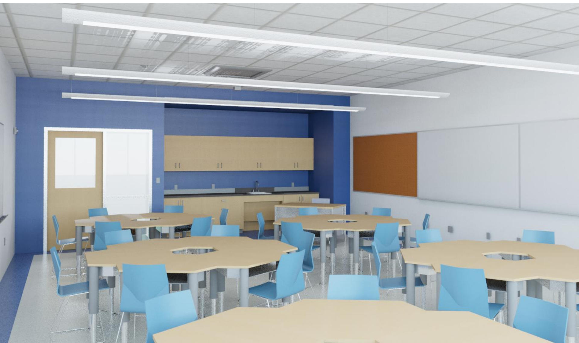
INTERIOR VIEW: CLASSROOM