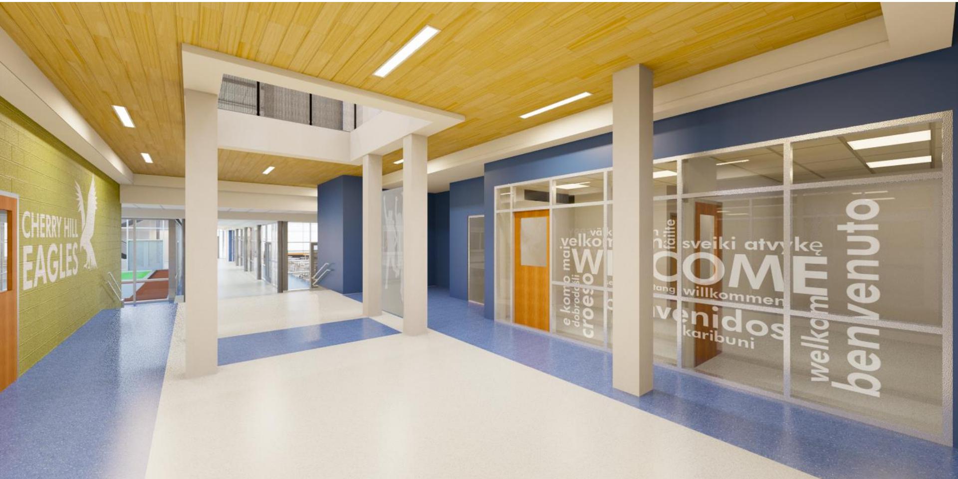
INTERIOR VIEW: MAIN ENTRANCE HALL