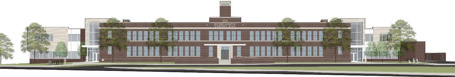
FRONT VIEW, Bridgeview Road