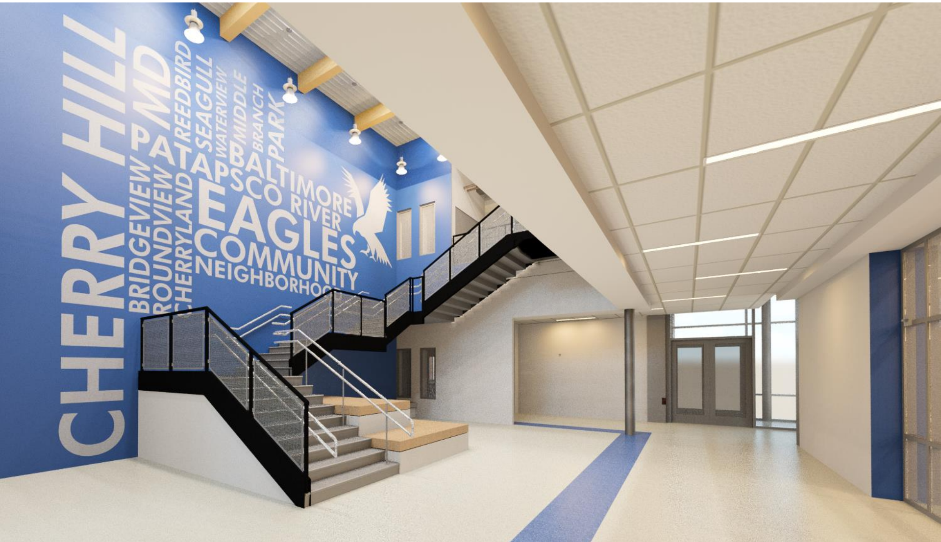
INTERIOR VIEW: CENTRAL STAIRCASE