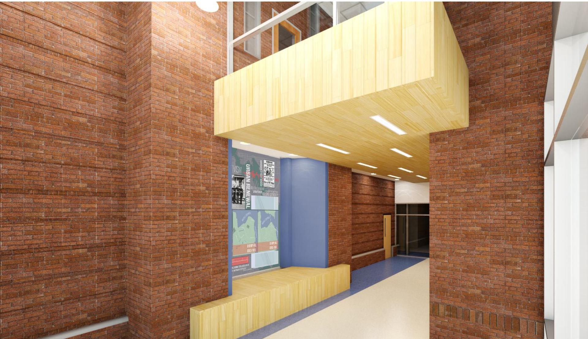
INTERIOR VIEW: SIDE ENTRANCE VESTIBULE