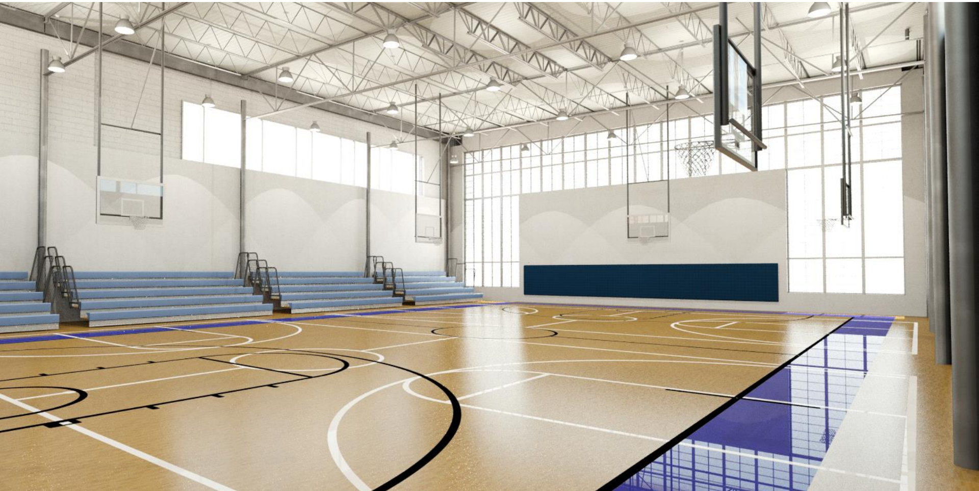
INTERIOR VIEW: GYMNASIUM