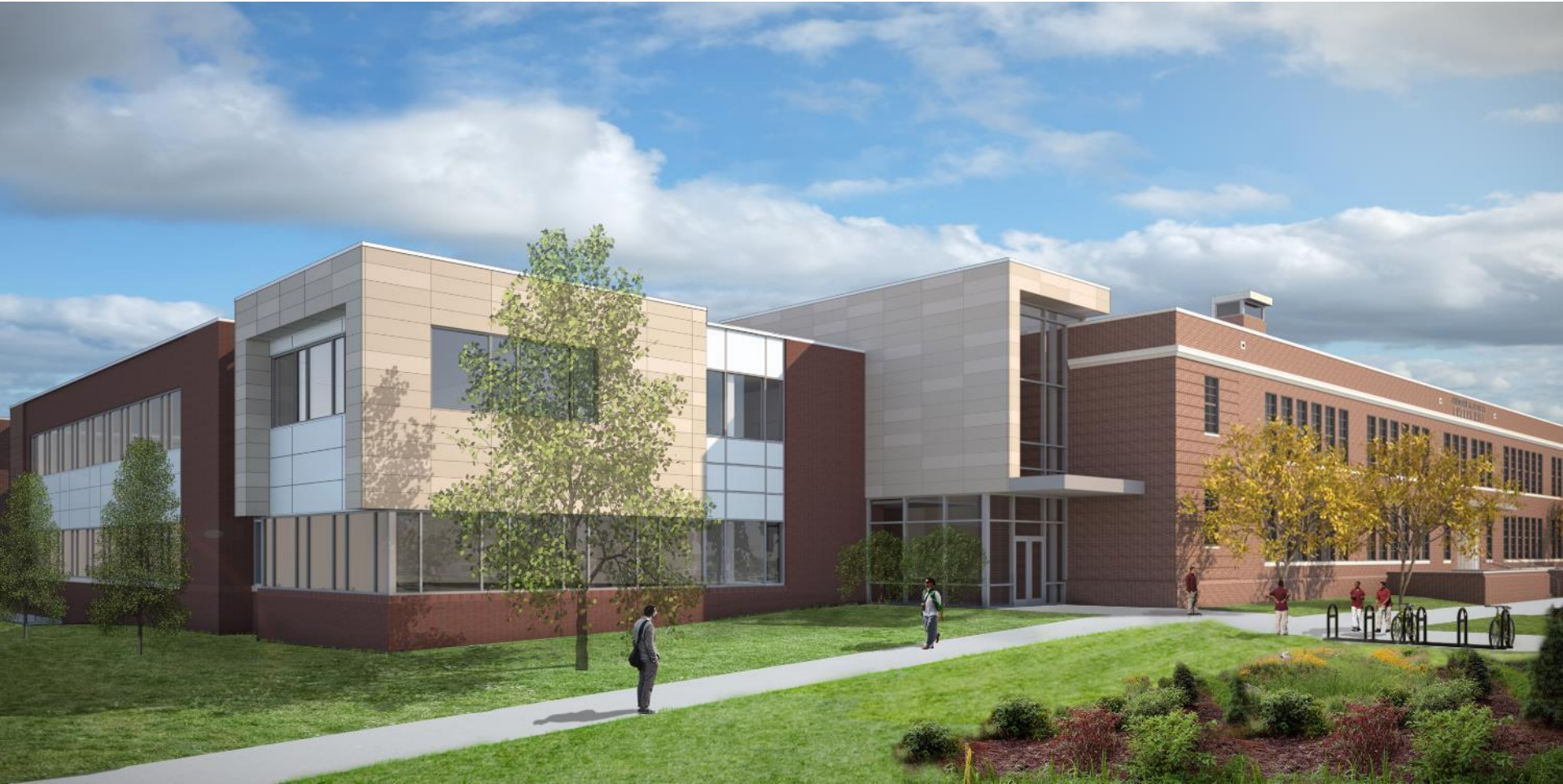
EXTERIOR VIEW: MAIN ENTRY