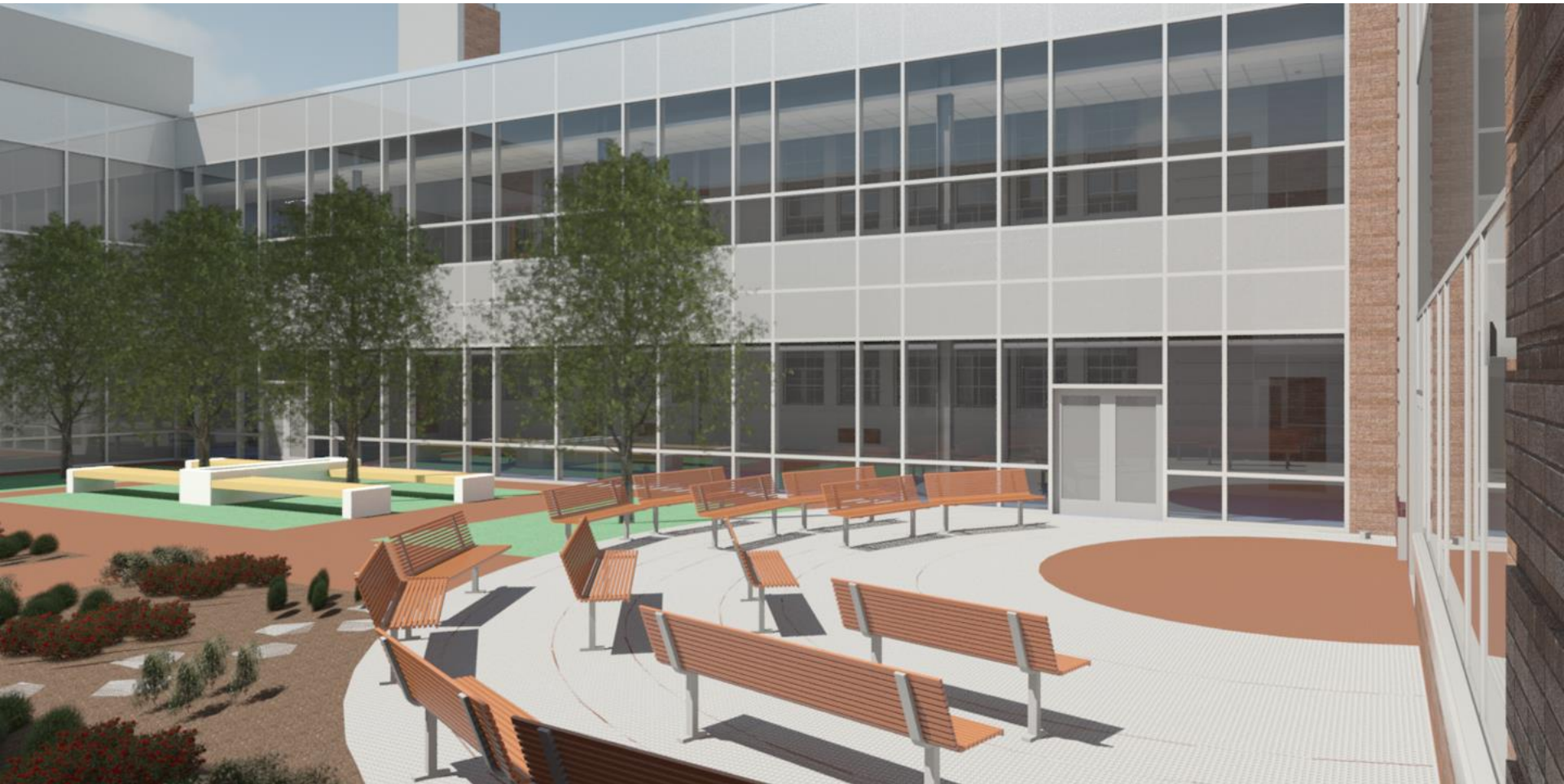
INTERIOR VIEW: COURTYARD