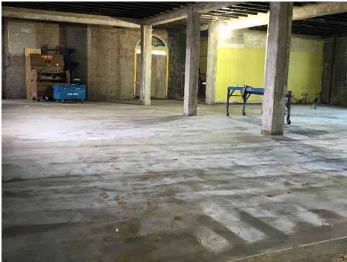
Existing Building - Interior