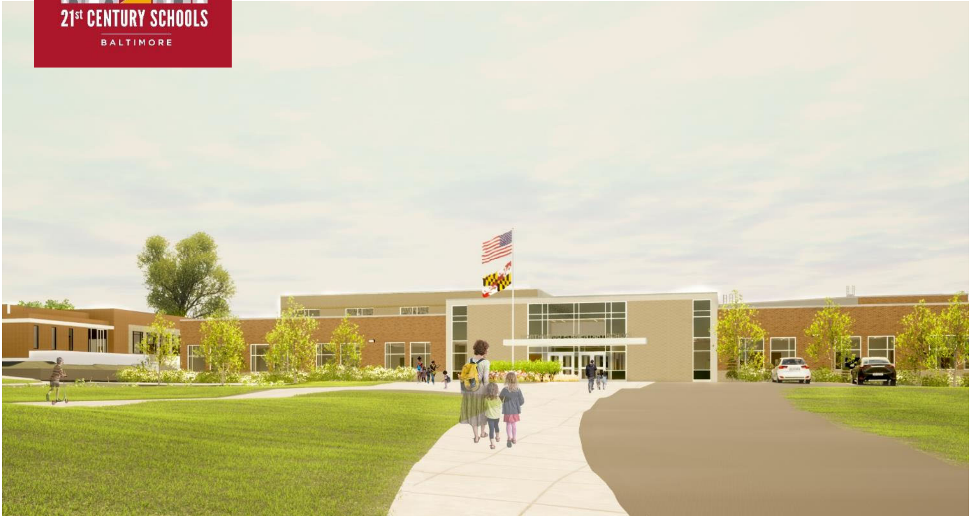
21 st Century School Buildings Program Northwood Elementary School | Construction Update Meeting October 14, 2020