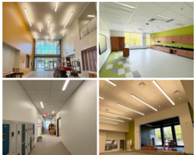
From top right: Cross Country Elementary/Middle School Fall Construction Update of the main entrance, science lab, hallway, and cafetorium.