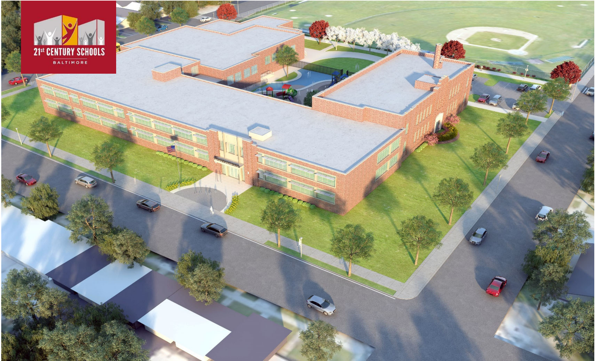
21 st Century School Buildings Program James Mosher Elementary School Construction Progress Meeting 7.14.20