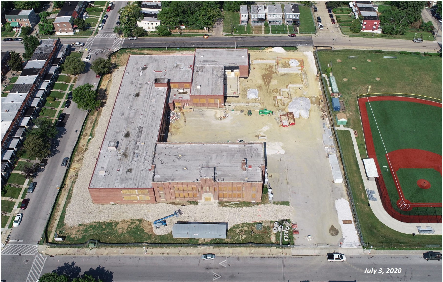
James Mosher Elementary School | Construction Progress Meeting | July 2020