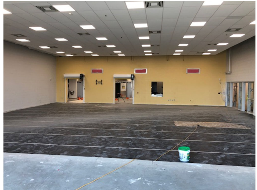
Harford Heights – Cafetorium