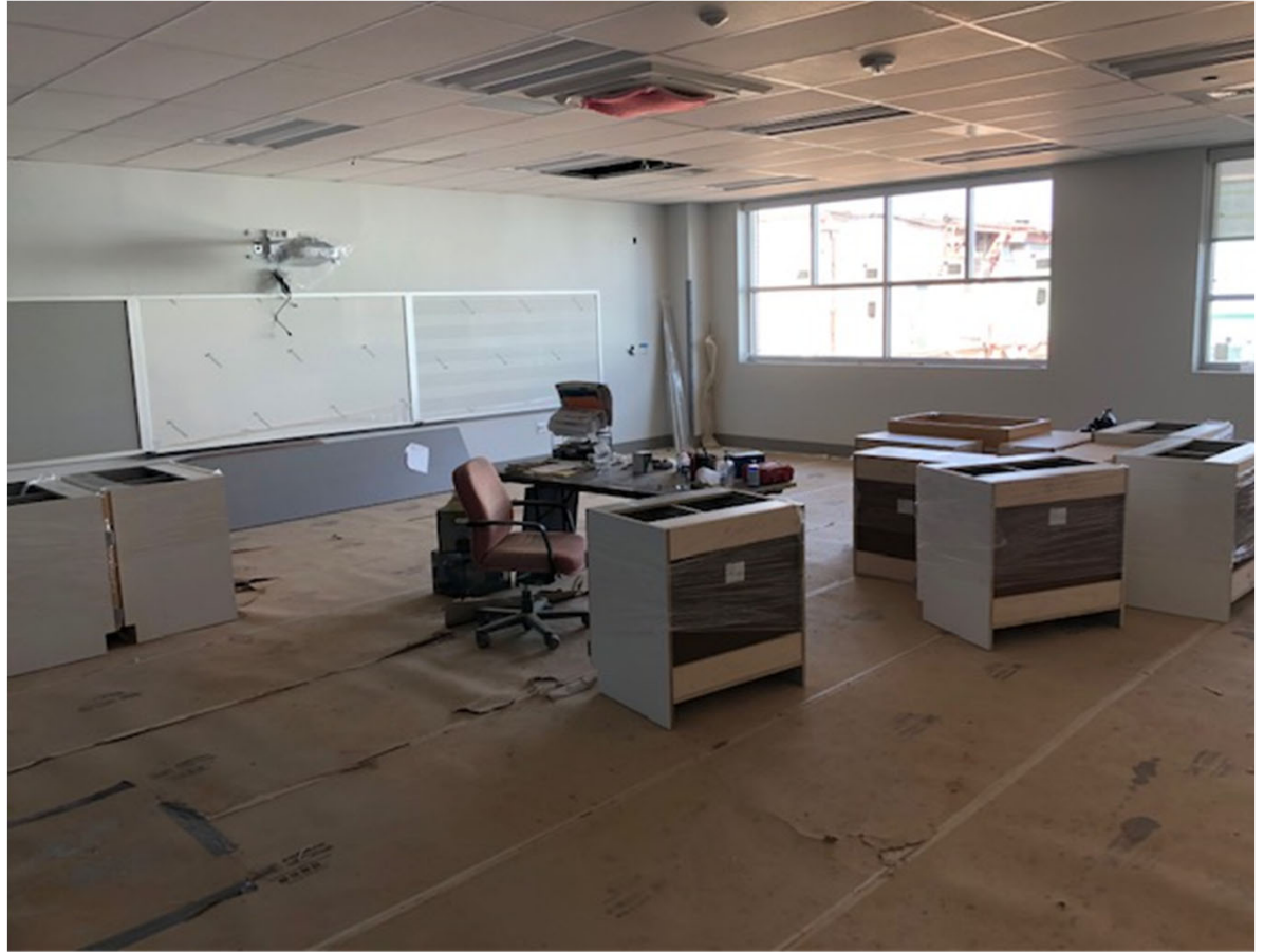
Sharp-Leadenhall - Classroom