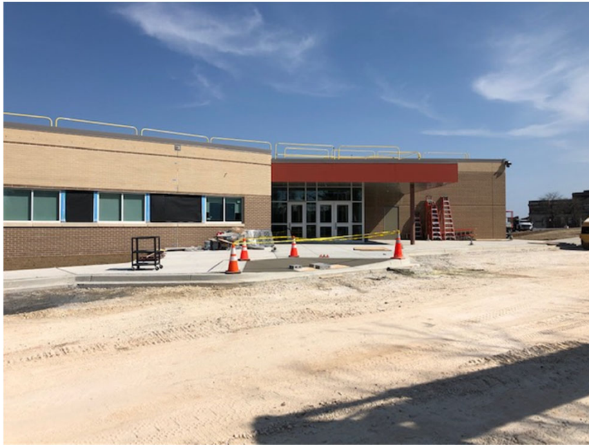
Main Entrance to Sharp-Leadenhall