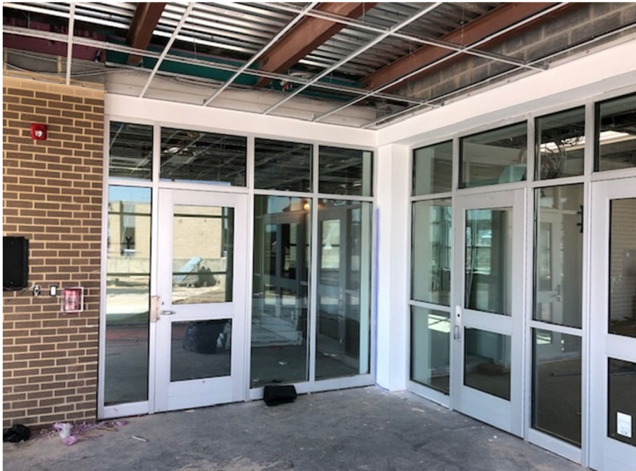
Typical Interior of Main Entrances