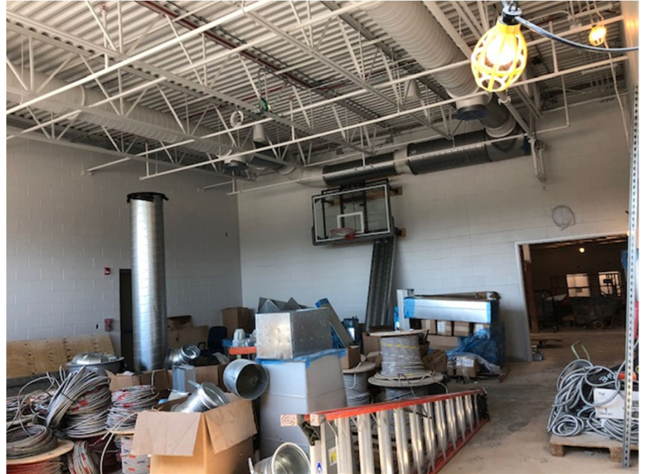
Sharp-Leadenhall - Gymnasium