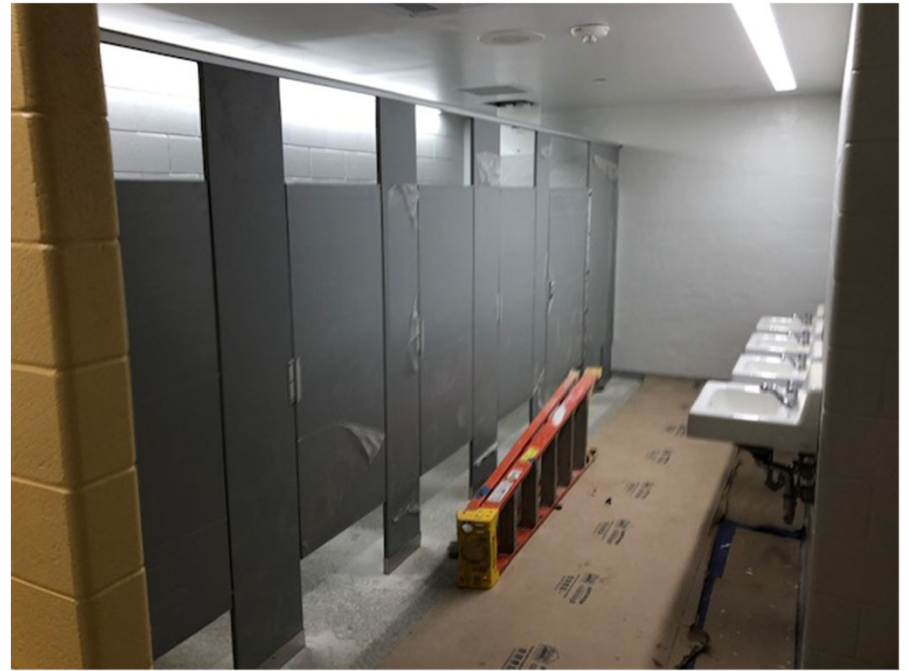
Typical Group Bathroom