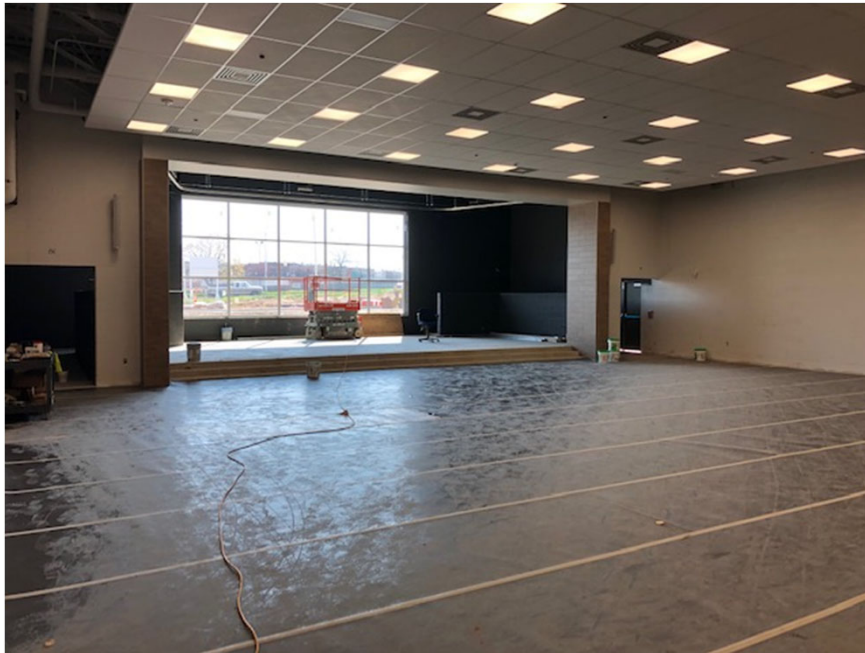
Harford Heights – Cafetorium