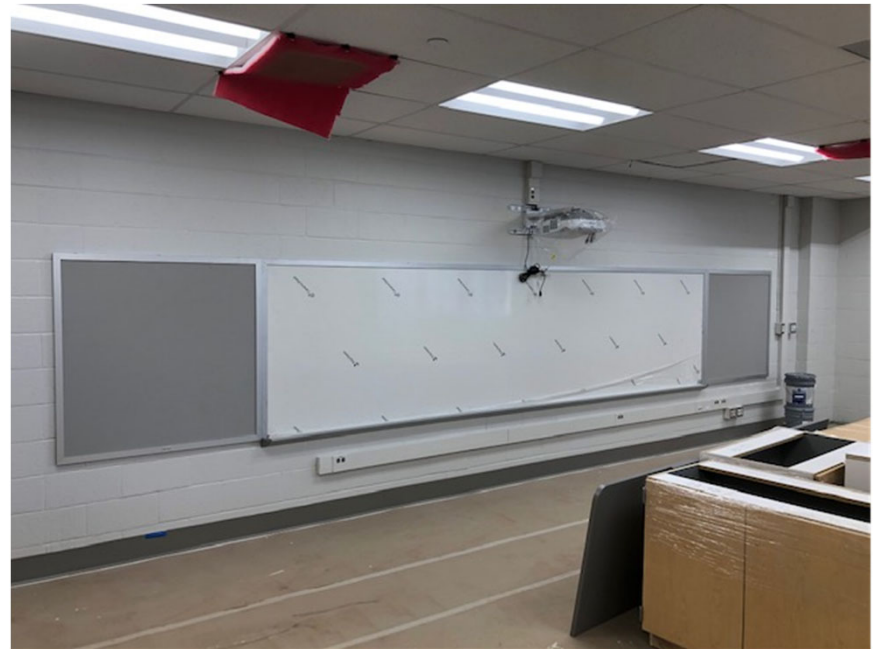
Harford Heights – Classroom