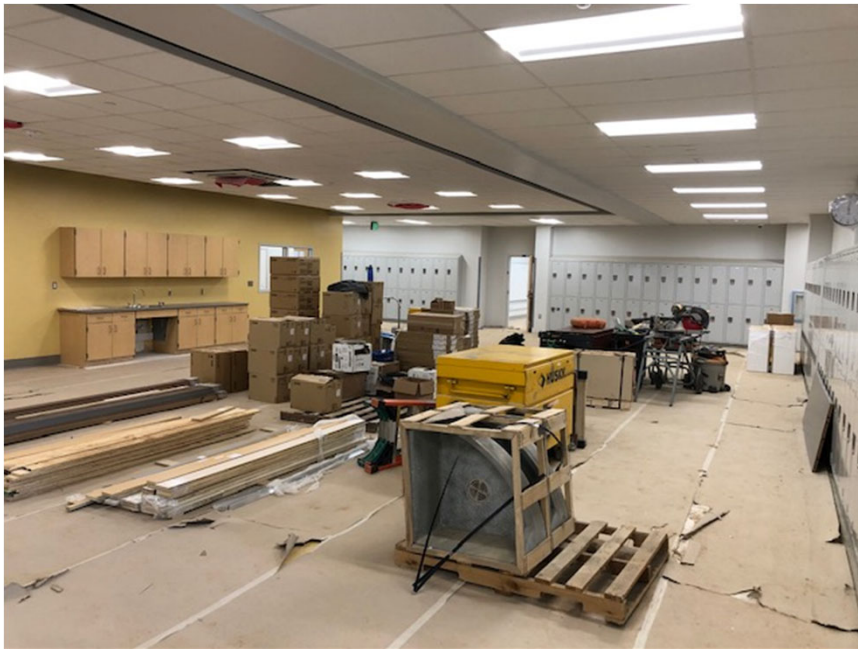
Harford Heights – Collaborative Learning Area