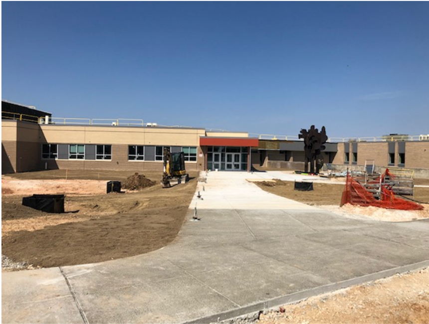
Harford Heights – Main Entrance