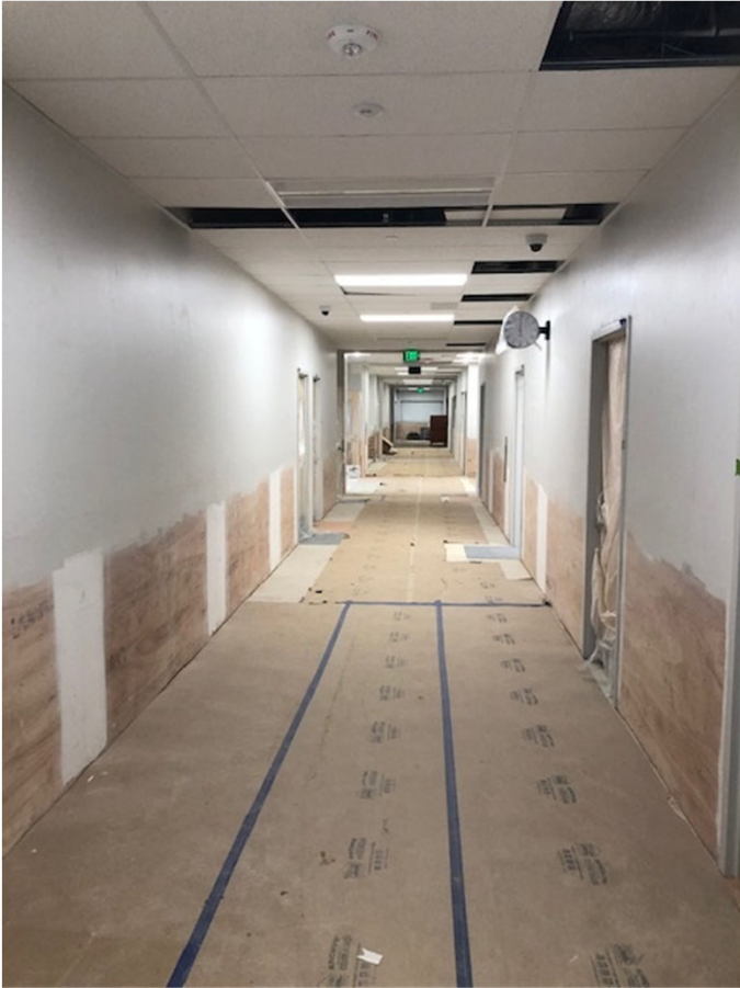
Sharp-Leadenhall - Corridor