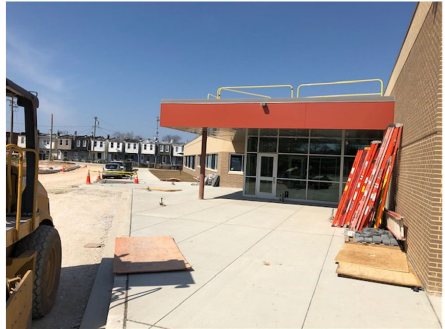
Main Entrance to Sharp-Leadenhall