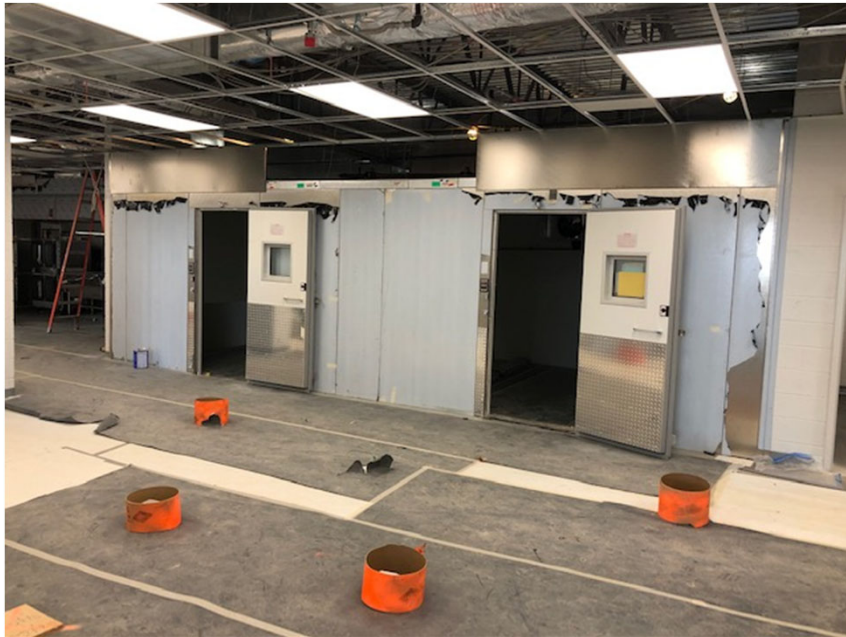
Kitchen Walk-in Boxes