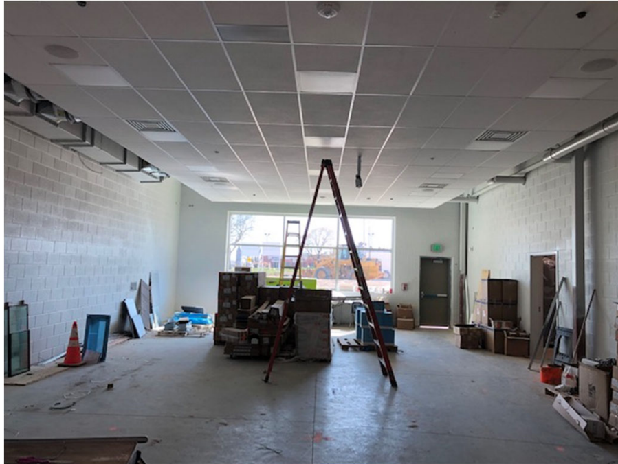
Sharp-Leadenhall - Cafeteria