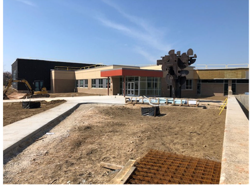
Harford Heights – Main Entrance