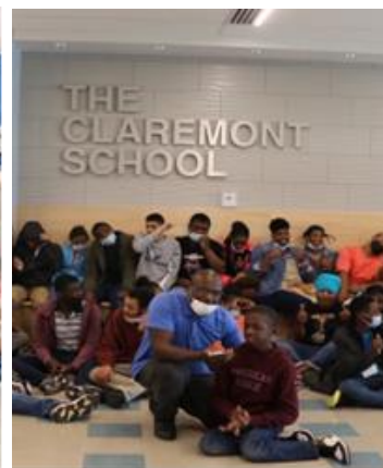
Claremont School Tours

The team also continued coverage of events led by the Academics and Engagement teams which included Indi Robot training for staff and students, STEM Day at Patterson High School, tours of Claremont with students and staff, Back-to-School Nights at Highlandtown Elementary/Middle #237 and Montebello Elementary/Middle, and school leadership tours of schools in construction.