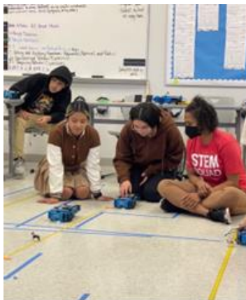
STEM Day at Patterson High School