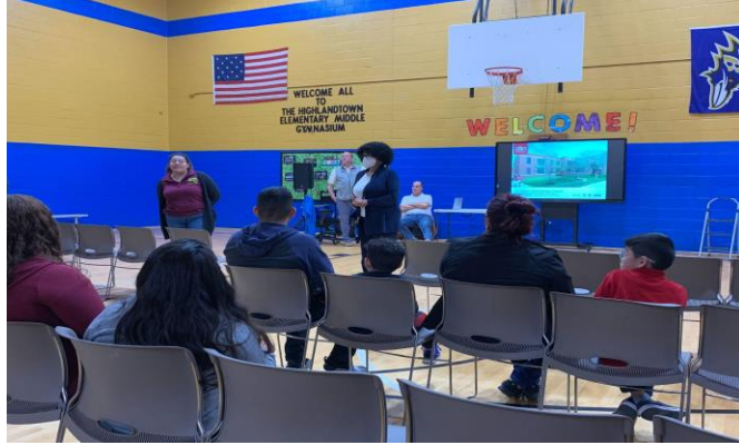
Highlandtown EMS #237's in-person community meeting