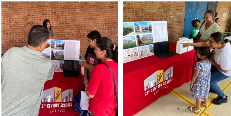
Highlandtown EMS #237's back-to-school summer event