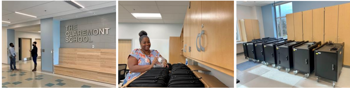
The Claremont School Technology Delivery and Setup

The 21 st Century technology team attended the Daly Computers Technology Showcase and Warehouse tour in Frederick, Maryland. This event featured a host of vendors and seminars tailored to the state/local government and education sectors. The team heard from industry technology experts, including HPI, Lenovo, Microsoft, SMART Technologies, Extreme Networks, APC, and more about the latest trends and innovations.