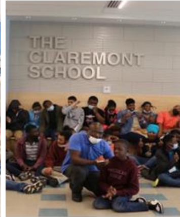
Claremont School Tours

The team also continued coverage of events led by the Academics and Engagement teams which included Indi Robot training for staff and students, STEM Day at Patterson High School, tours of Claremont with students and staff, Back-to-School Nights at Highlandtown Elementary/Middle #237 and Montebello Elementary/Middle, and school leadership tours of schools in construction.