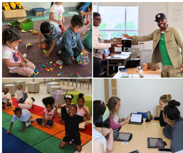
From top right: Camp Curiosity, A2A, Fine Arts Camp, Kindergarten iPad Blended Learning.