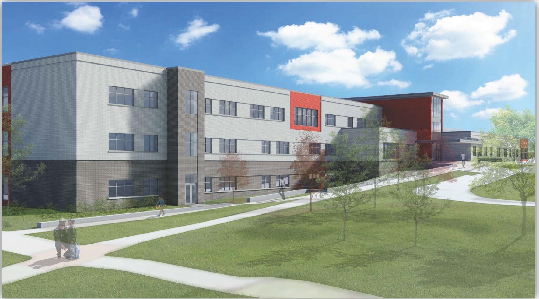
BAY-BROOK ELEMENTARY/MIDDLE SCHOOL