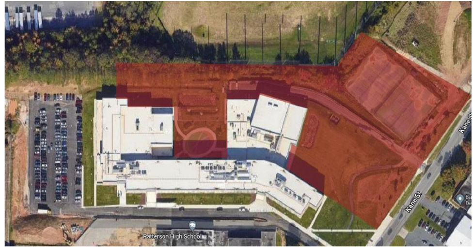
Ground-Level Affected Area

Golf balls from a neighboring golf center have been noted in the vicinity and there is concern regarding possible injury and property damage.