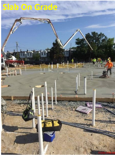
Slab On Grade