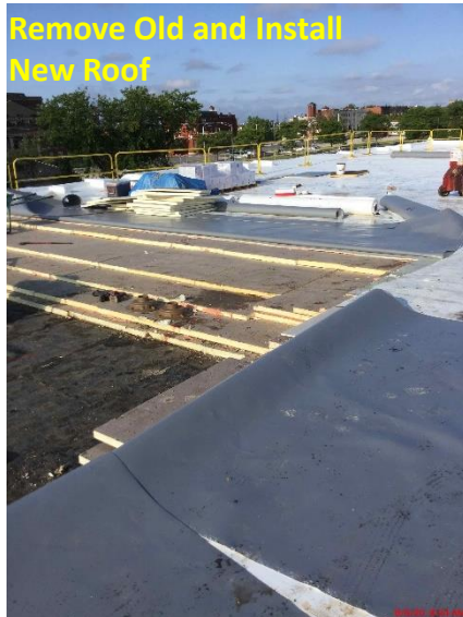
Remove Old and Install New Roof