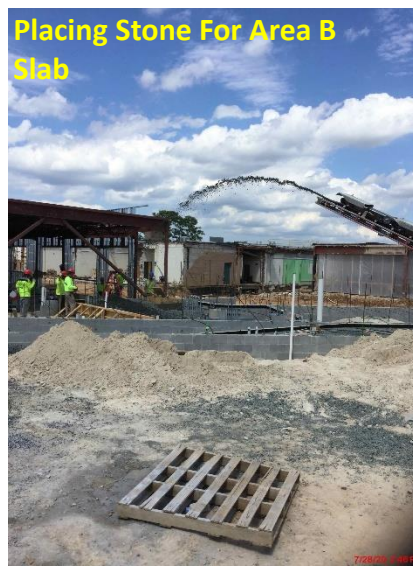
Placing Stone For Area B Slab