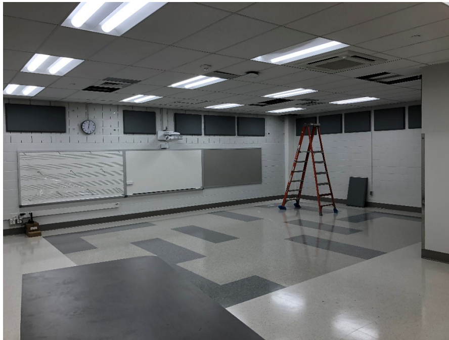
Harford Heights – Music Room