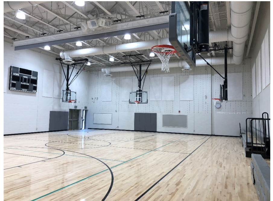
Harford Heights – Gym