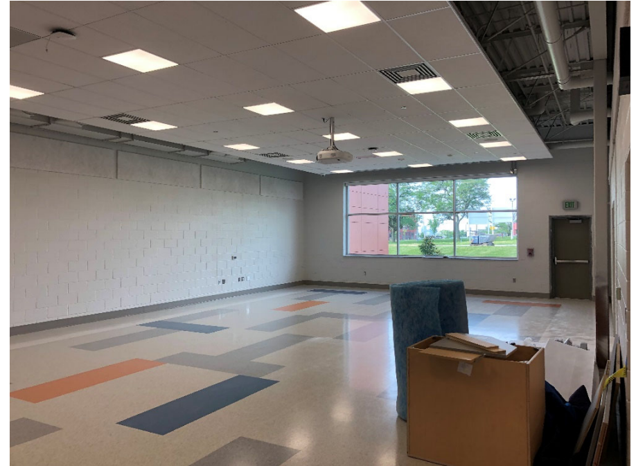
Sharp-Leadenhall - Cafeteria