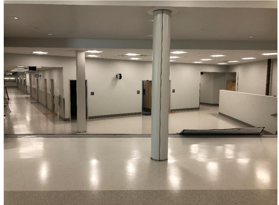
Sharp-Leadenhall – Main Lobby