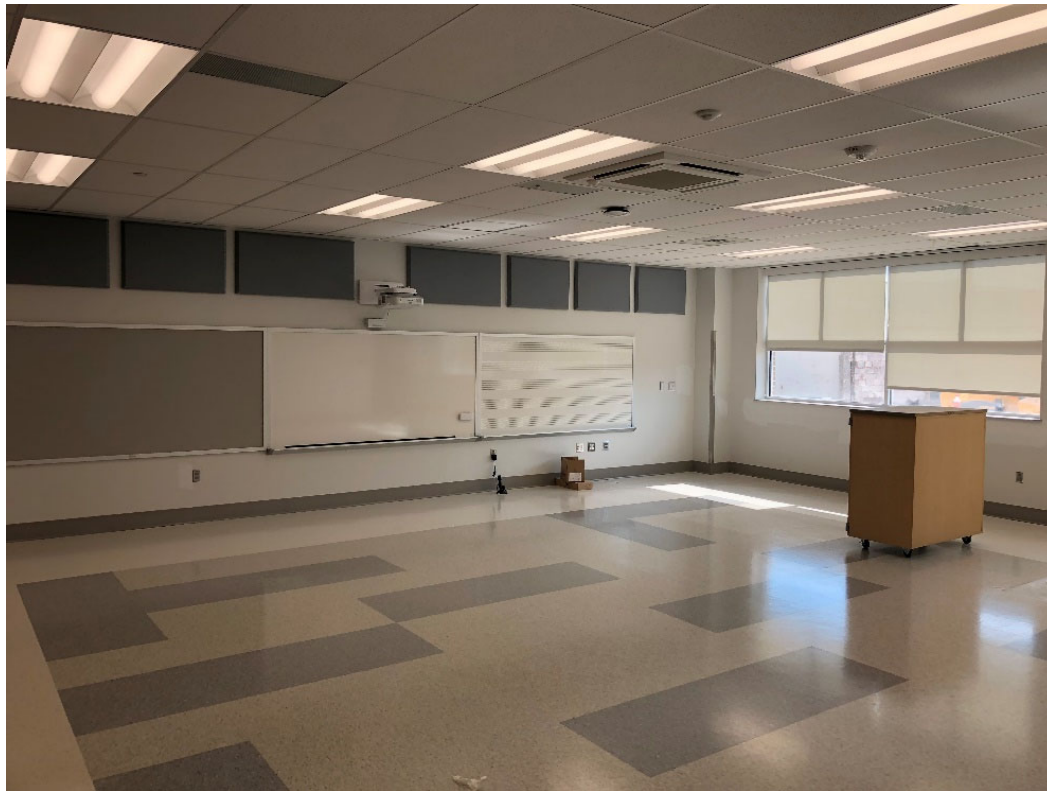
Sharp-Leadenhall – Music Room