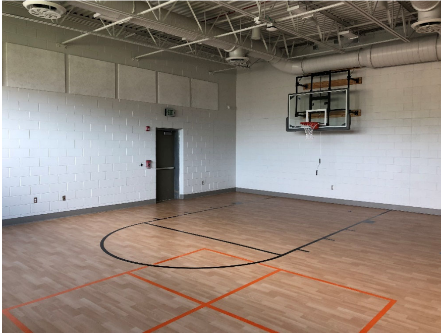
Sharp-Leadenhall - Gym