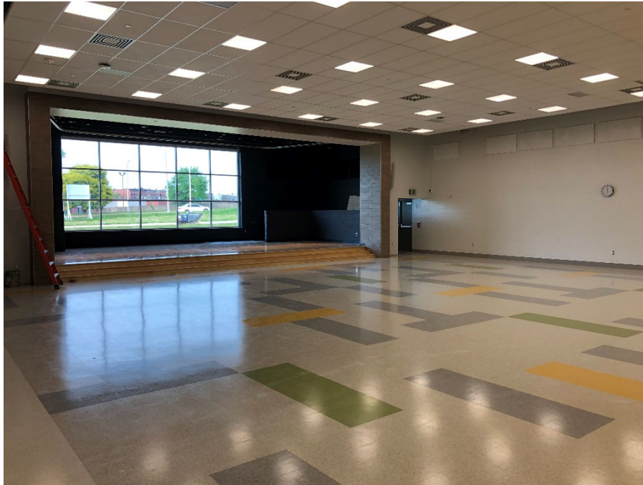
Harford Heights – Cafetorium