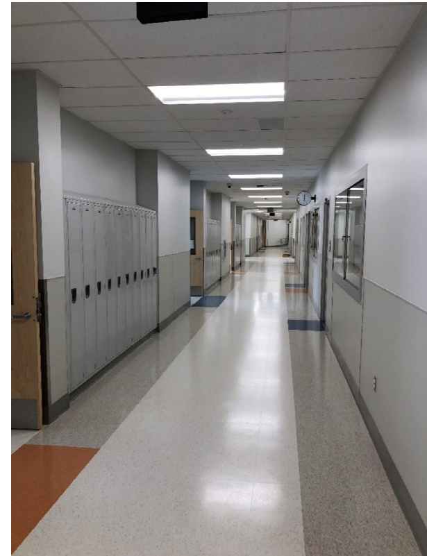
Sharp-Leadenhall - Corridor