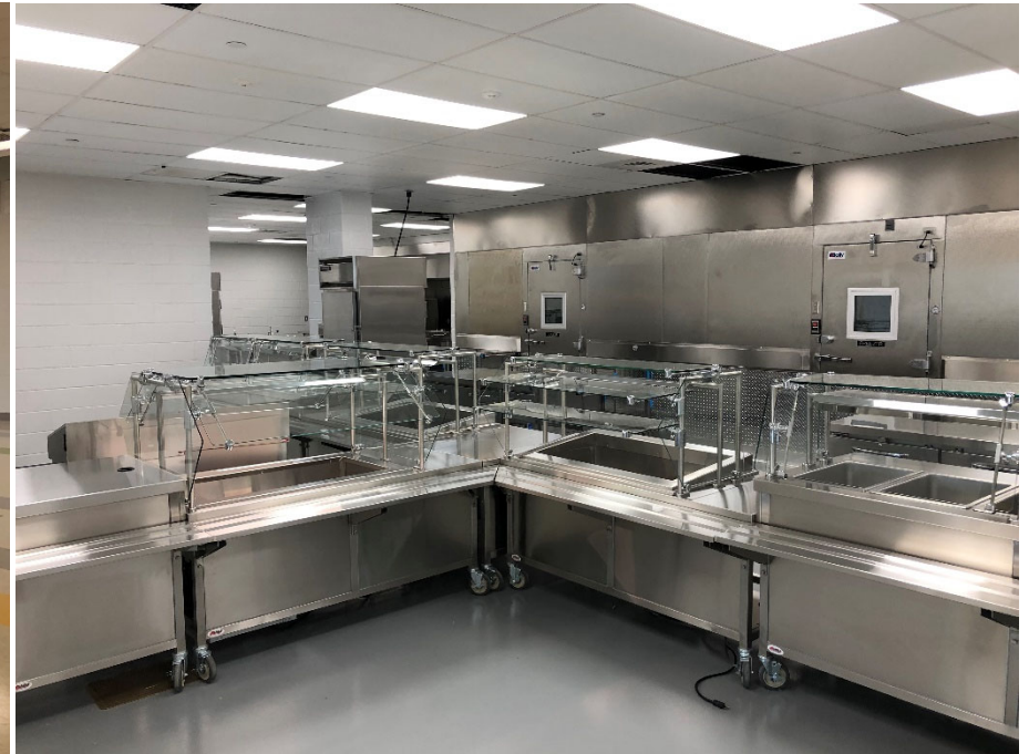
Harford Heights – Kitchen