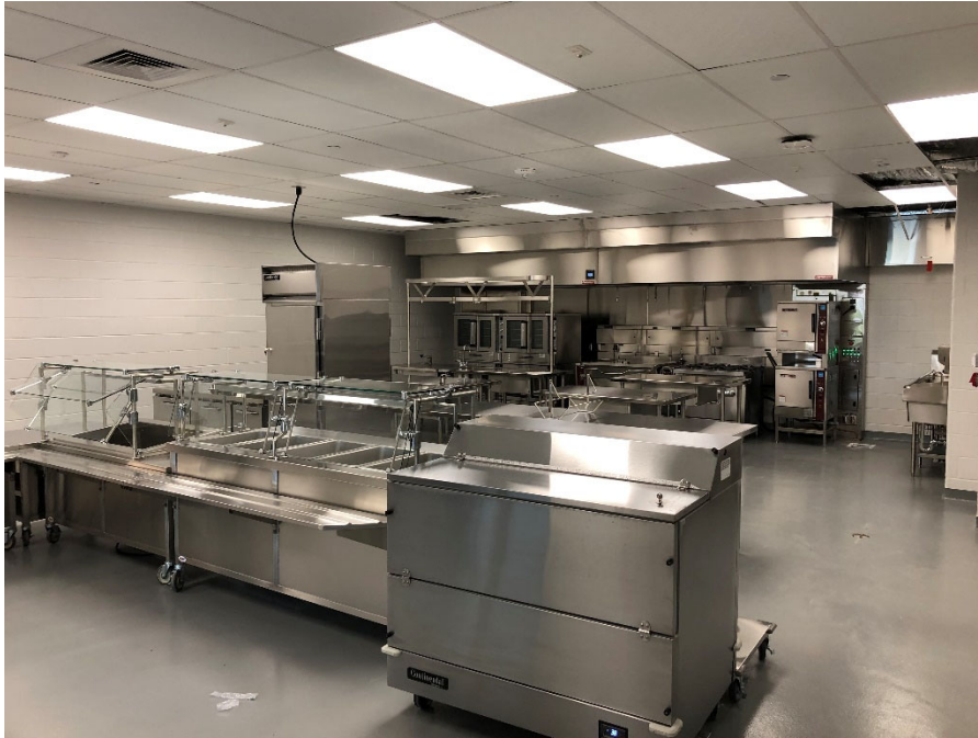
Sharp-Leadenhall - Kitchen